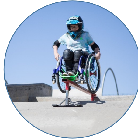
Spinal Cord Injuries