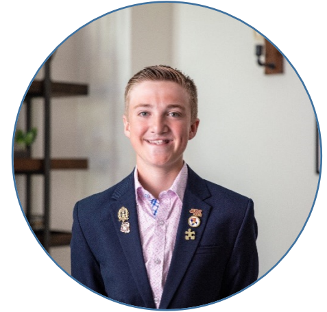
Cleft Lip and Palate